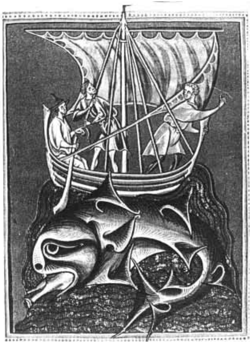
A twelfth-century picture of Brendan's ship alongside Jasconius, the friendly whale.