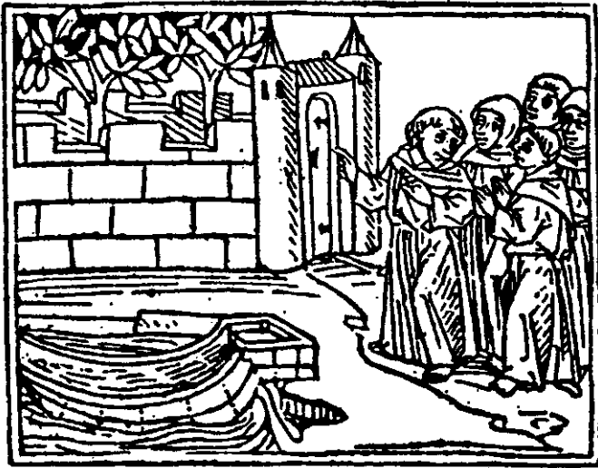
Plans for Brendan's great voyage into unknown seas are discussed.